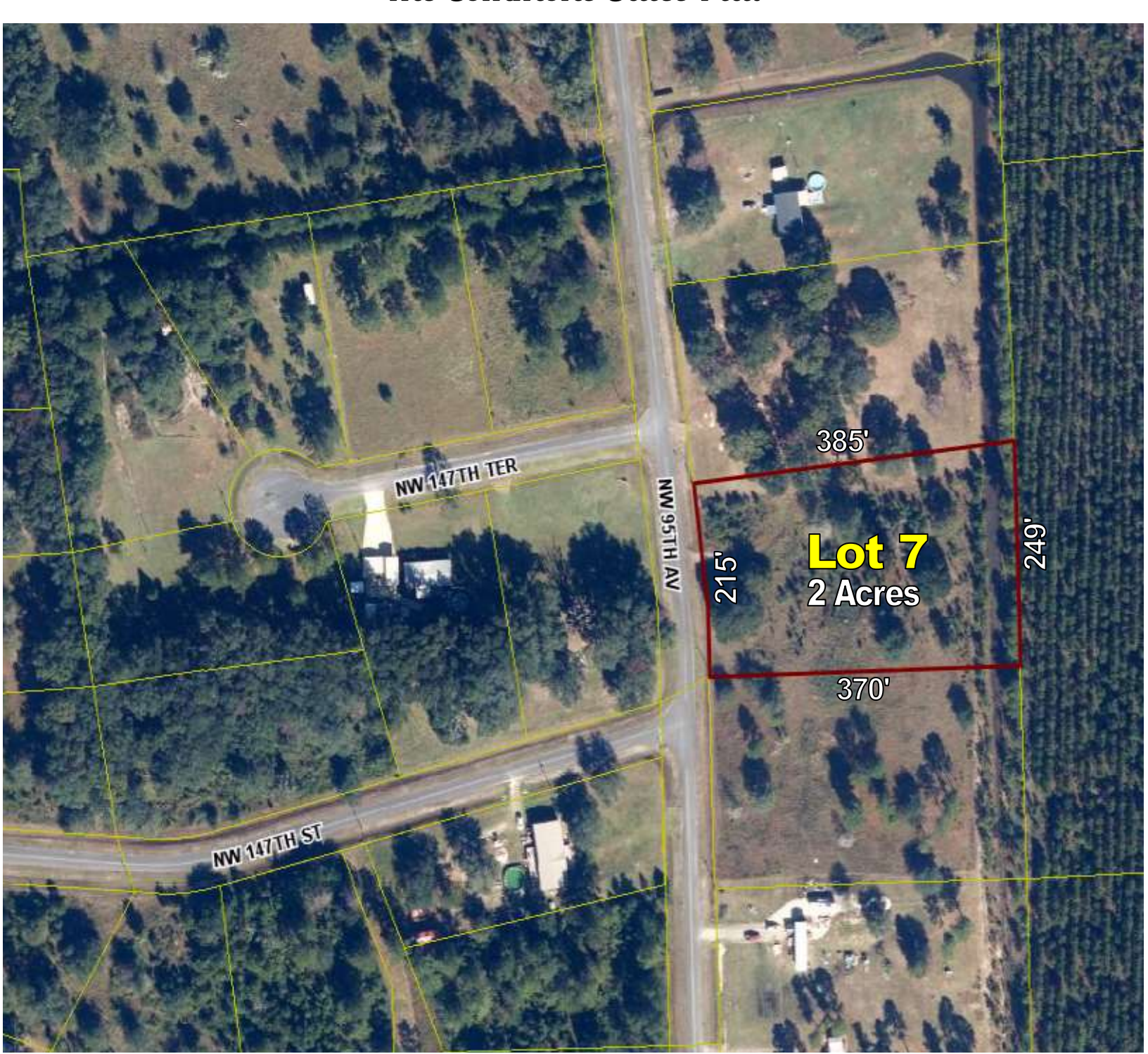
*Refer to recorded plat for survey details