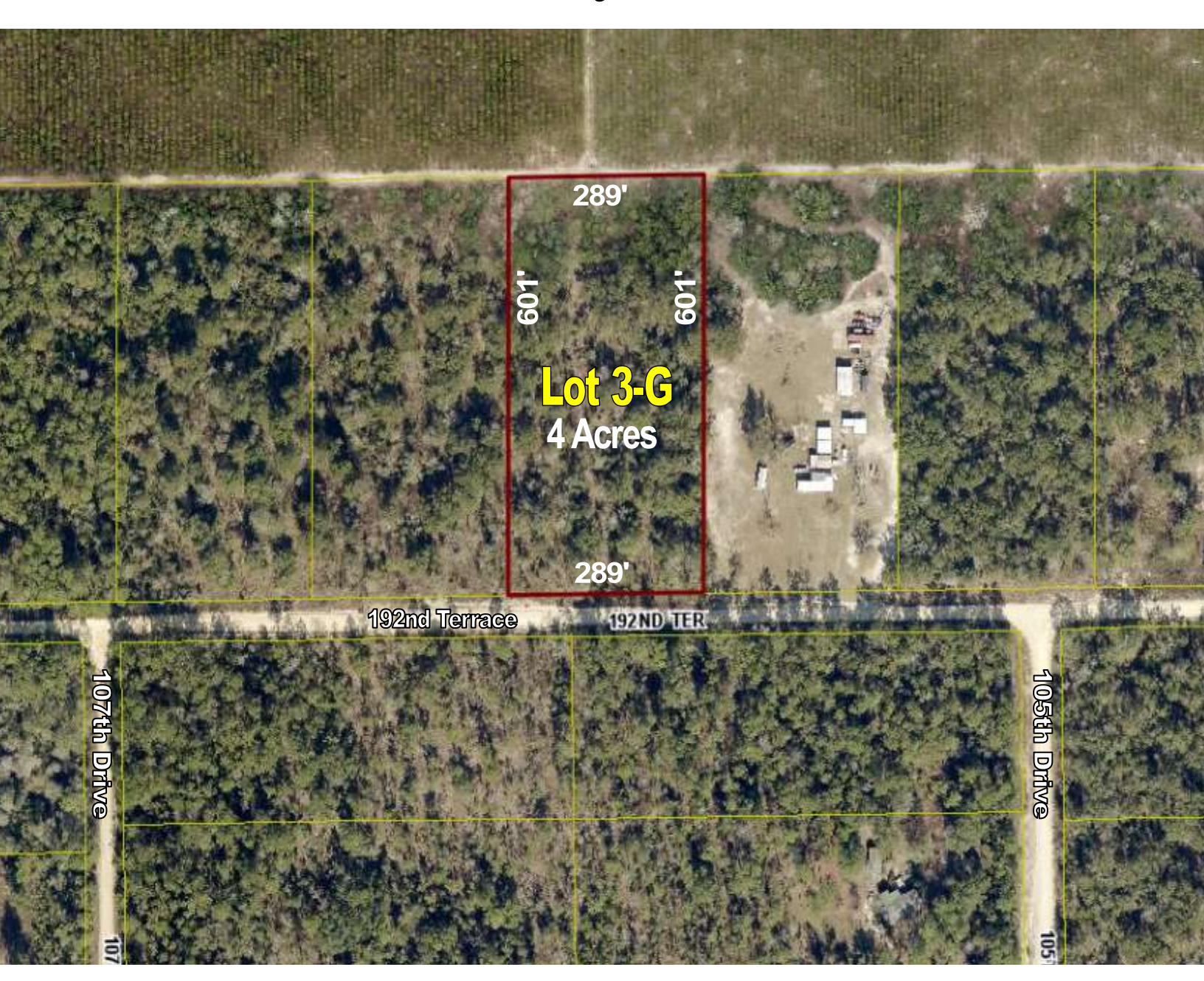
Automatic, Non-Qualifying Seller Financing is available with NO Pre-Payment Penalties